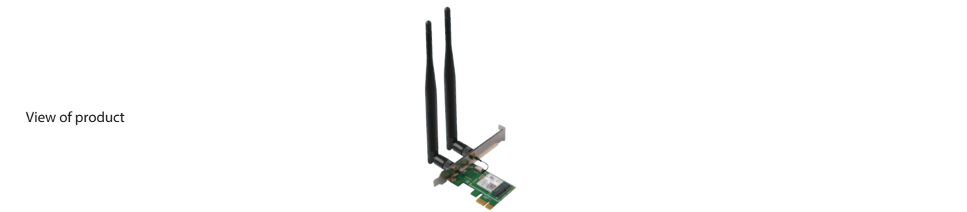
View of product