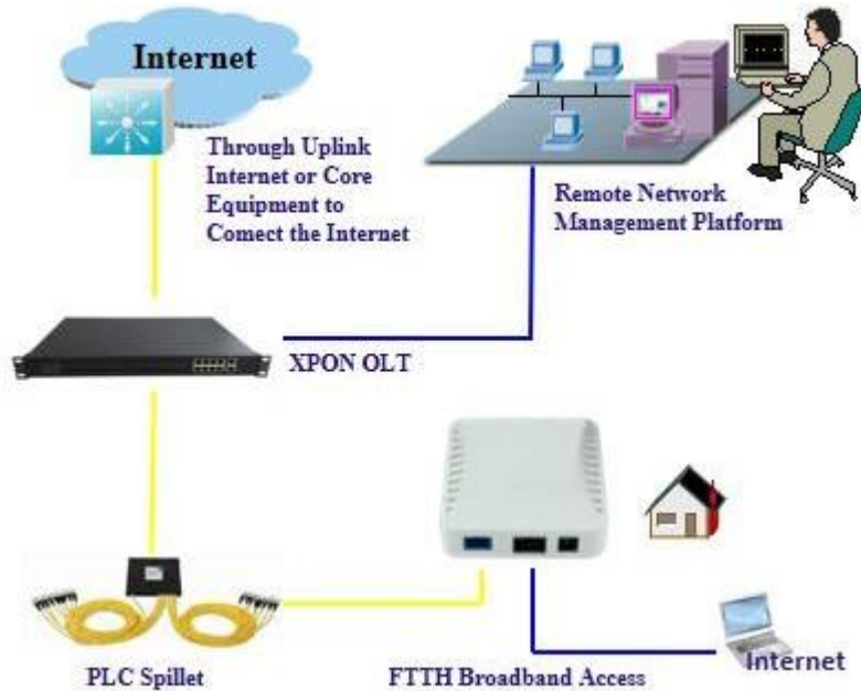
Figure: FD521G-HZ670 Application Diagram